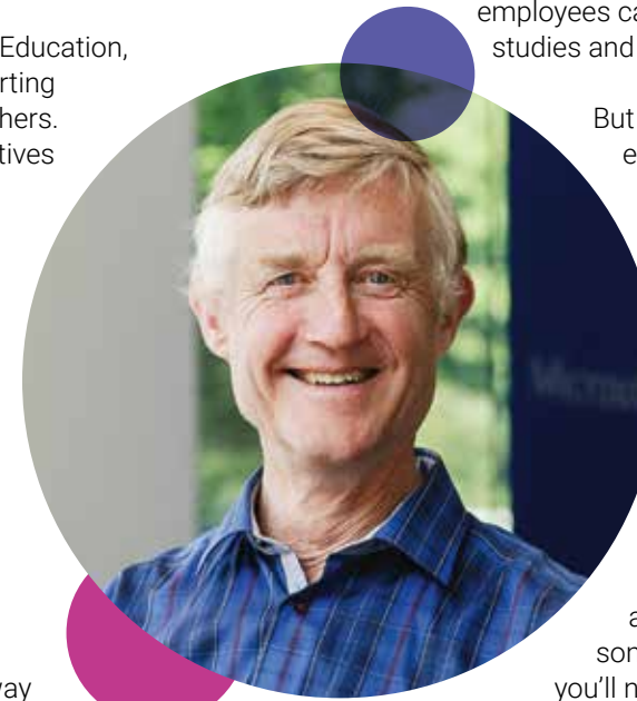
Simon Peyton Jones Microsoft Research, and Chair of the NCCE